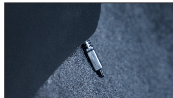
Step 6: To change light settings, ensure IR Receiver is not blocked when using the controller.