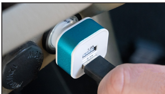
Step 5: Connect the USB LEDs into USB adapter.