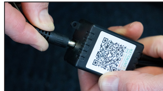
Step 2: Plug-in the USB power cable into the lights.