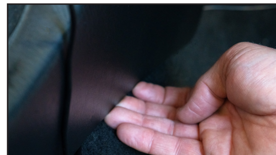
Step 4: Ensure wires are routed and tucked away safely from driver pedals or steering wheel.