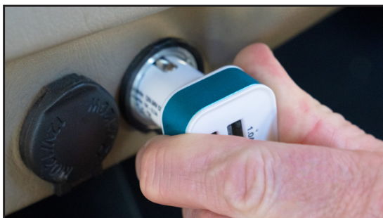
Step 3: Insert USB adapter into 12V DC socket in car.